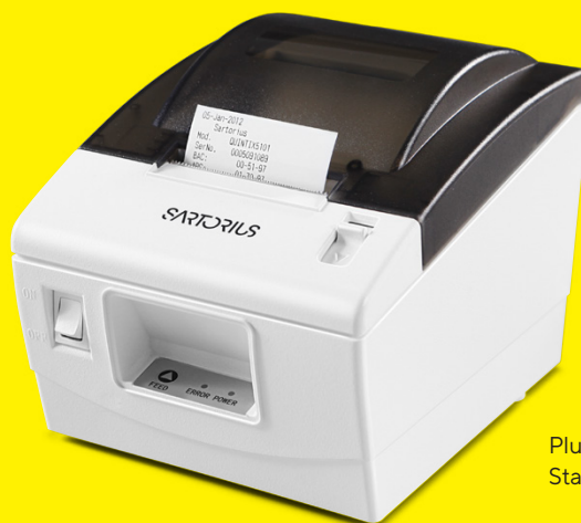
Plug & Play Standard printer YDP40