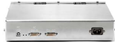
YC012-Z, Ex-link converter