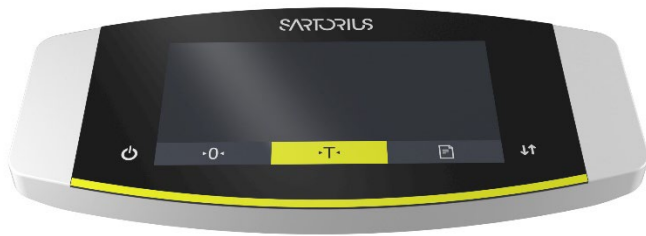
YRD01 Display with control panel (optional)